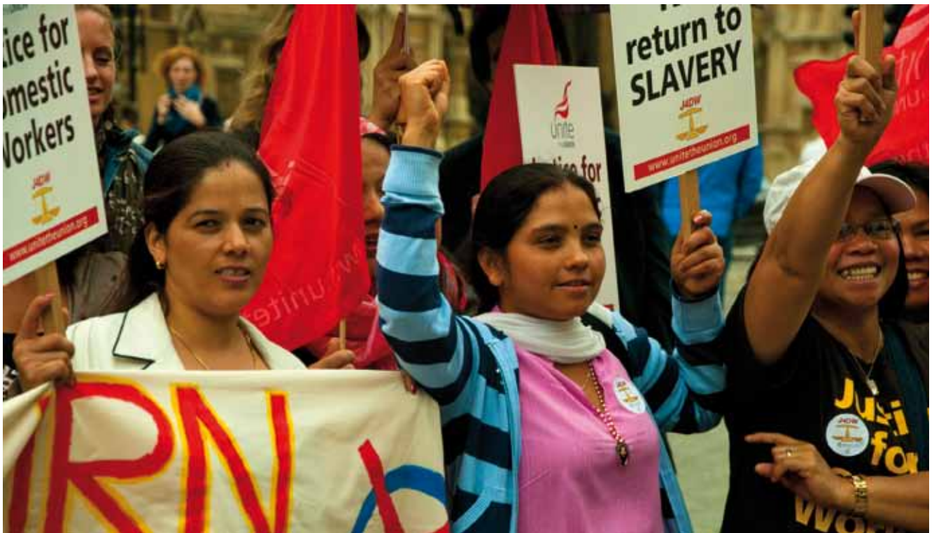
On 4 September, migrant domestic workers rallied outside the Houses of Parliament in London