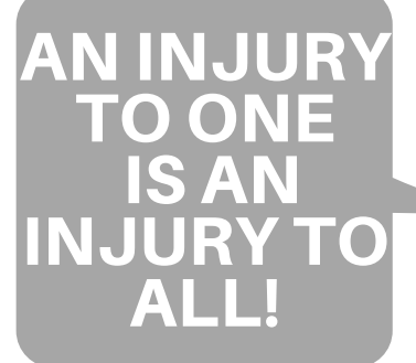
Click here for our statement.